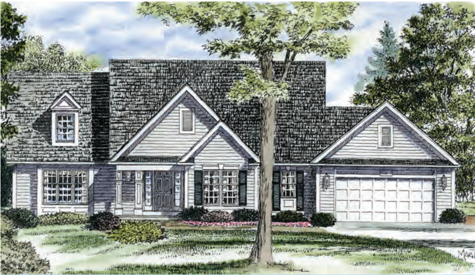
Front Elevations may vary depending on location.